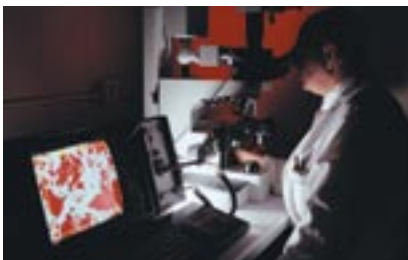
Scientist examining rat brain scan

In some cases scientists predict the possible outcomes of an experiment. A hypothesis can include a prediction of what might happen. In the last activity, your hypothesis included a prediction about the results. To make sure they don't influence results, scientists studying people often do not predict the possible results of their experiments.